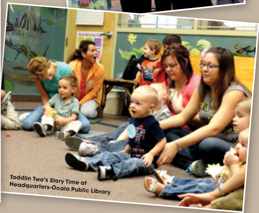
Toddlin Two's Story Time at Headquarters-Ocala Public Library